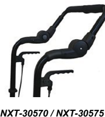
NXT-30570 / NXT-30575