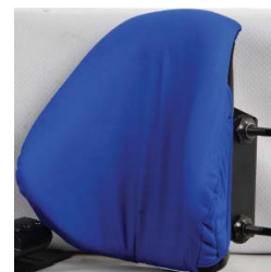
Blue Blizzard Startex Fabric