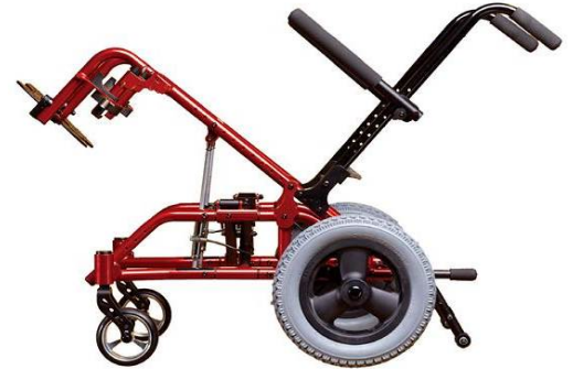
Weight Capacity: 225 lbs Limited 5 Year Warranty on Frame and Axles