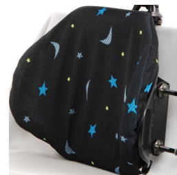
Kid*a*bra Meshtex Fabric