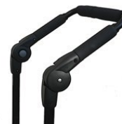
NXT-30580 / NXT-30585