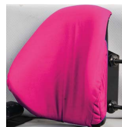
Pink Lollipop Startex Fabric